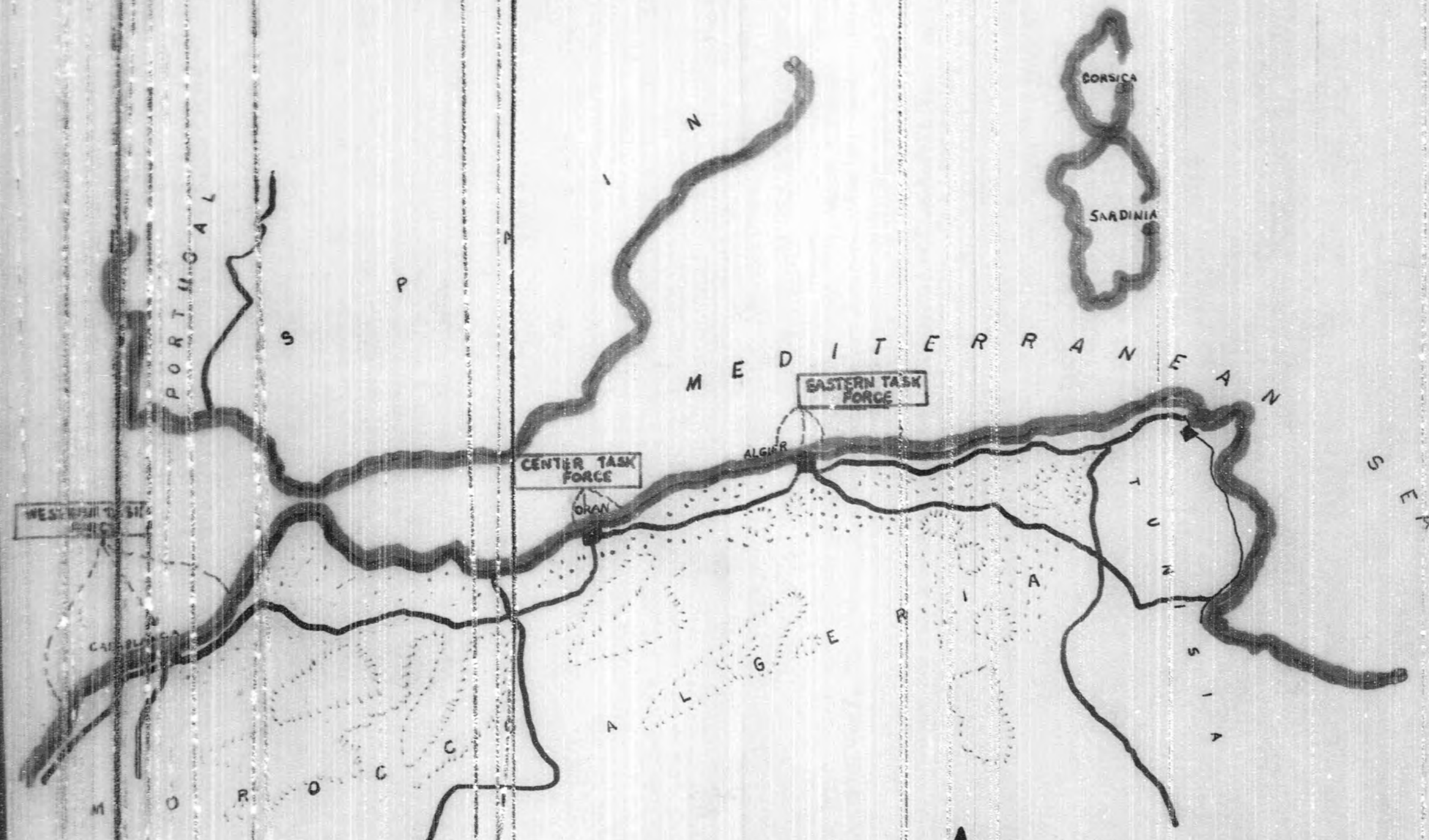
MAP "A" THE ALLIED INVASION NORTH AFRICA